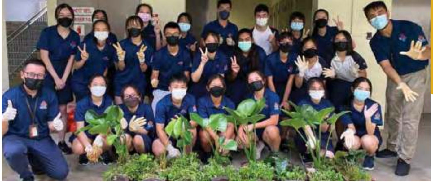
Planting new life