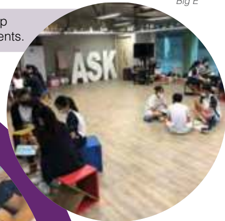
CID3 Marketplace Group formation at Big E