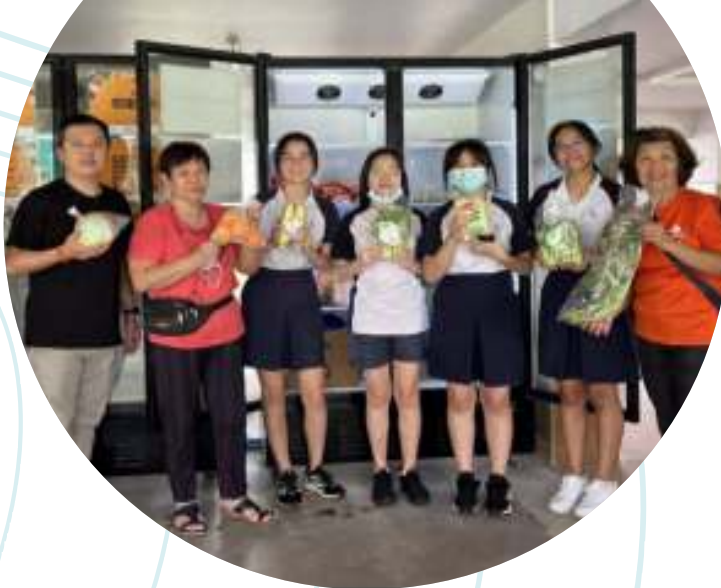
Our students donating their harvest from our school's farm to the residents in Boon Lay