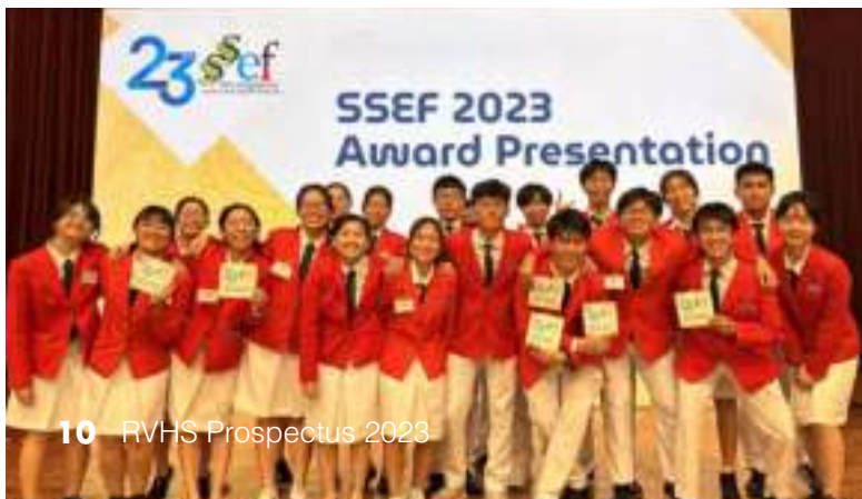
Winners of the Singapore Science & Engineering Fair