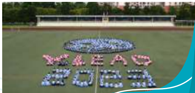
Y.LEAD Mass Display