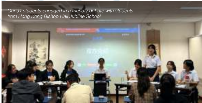
Our J1 students engaged in a friendly debate with students from Hong Kong Bishop Hall Jubilee School