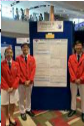
Our CID4 Mathematics students attained the 3M Best Project Award for their Science Mentorship Programme project