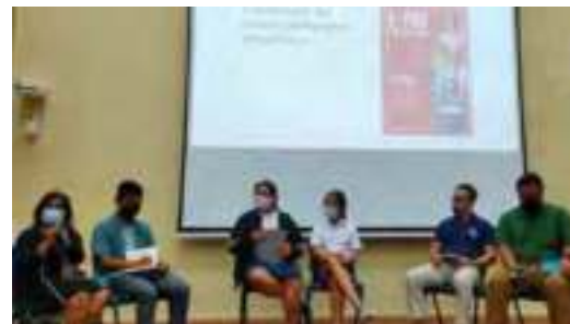
A panel discussion on race issues in Singapore by RV teachers and an alumnus.