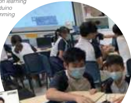
Sec 3 students engaging in hands-on learning with Arduino Programming

Students have the opportunity to hone their leadership skills through leading, planning and implementing events such as the River Valley Mathematics Challenge, the Mathematics department's key student-centered event organised for primary school students. MLA further promotes student agency through MyMLA, a leadership platform that empowers students to propose bottom-up initiatives which they are passionate in, to lead and take charge. As students value-create in support of MLA's objectives, they also find greater purpose as contributing members of the academy.