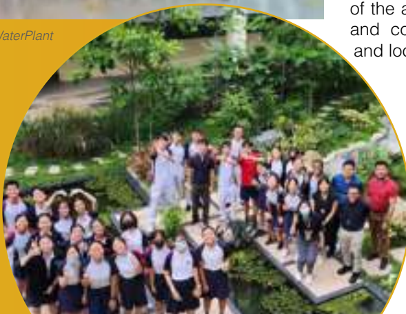
Guardians of Eco-Trail@RV