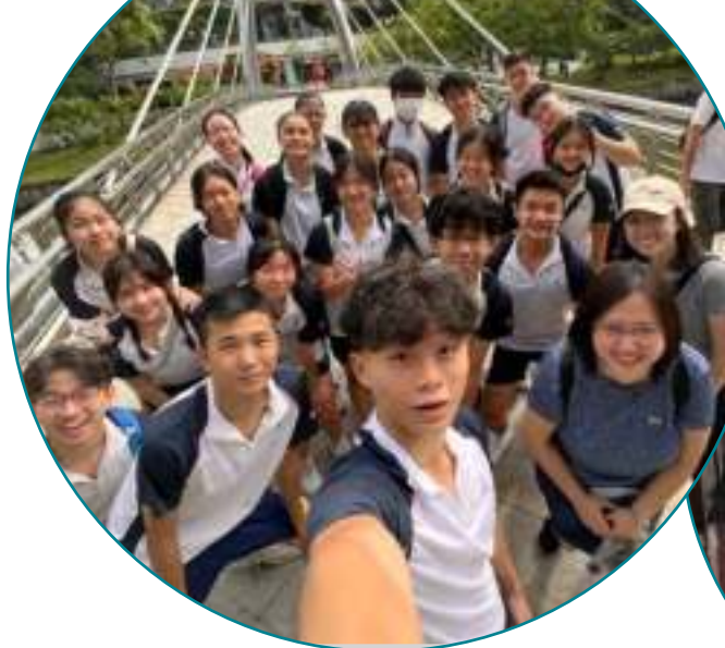
Sec 4 NE Hike

At the Team and Community Leadership levels, students take up appointments and responsibilities in their various CCAs, Councils and Academies. The RV student leaders have a myriad of opportunities to serve, be empowered and to inspire RVians through different areas of interests and platforms. Students positively influence others, are proactive in addressing community needs, and show interest in national and global issues. They will also have opportunities to engage and interact with other student leaders, local and overseas.