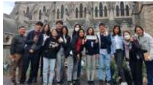
Creative storytelling and play acting at the Dublinia Viking Museum

Through various platforms such as academic modules and local and overseas experiential learning journeys, HSSLA students gain insights in the multi-faceted field of the humanities and learn about issues that are pertinent to the human condition. They also have various opportunities to hone their leadership skills: student leaders may plan and execute an annual signature school-wide HSSLA event or take lead in running a student-led academic module.