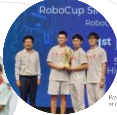
We won the Influencer Award at RoboCup Singapore!