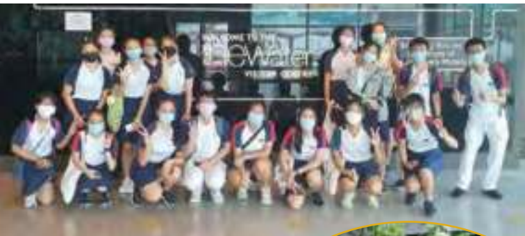
Learning Journey to NEWaterPlant

Students conduct ecological fieldwork and environmental studies investigation, and work under the guidance of researchers and lecturers at institutes of higher learning. As part of the talent management of the academy, students can also get to participate and compete in international student conferences and local workshops.