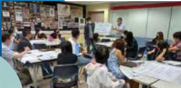
Our Senior Teachers sharing best practices on positive education with the staff