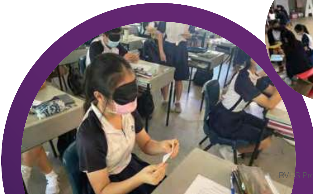
Empathy masterclass conducted by CID3 students