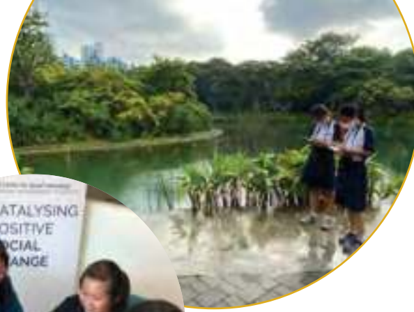
HSSLA members at Jurong Lake Park for Nature Journaling module