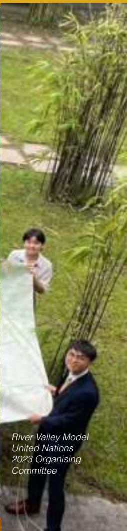
River Valley Model United Nations 2023 Organising Committee

For our students' achievements and list of scholarship recipients, please visit our school website.