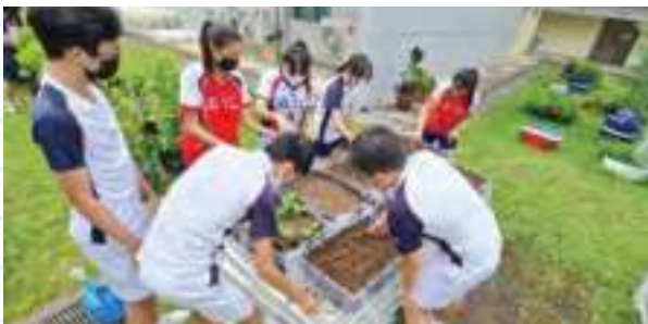
Our students harvesting their Japanese Kailan from their class farm

As organisers and hosts of the Y.LEAD Seminar, RVians also gain valuable experience from conceptualising, planning and organising such a large-scale seminar.