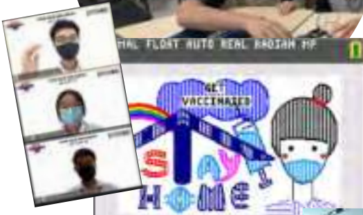
Winning entry from our students for the Design with TI GC Competition