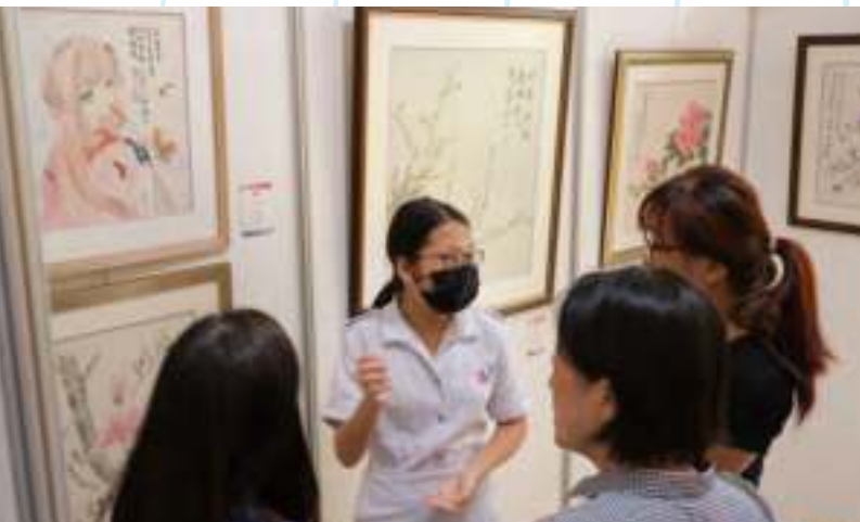
Our guests viewing our students' artwork