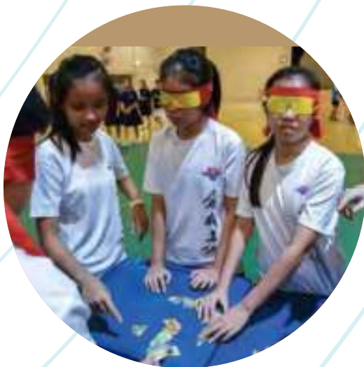
Teamwork at the Leadership Development Camp

In addition, to develop leaders of distinction for Singapore, the leadership development component of the curriculum incorporates leadership skills which are grounded in sound moral values. It is developmental and every RVian will have the opportunity to take up the mantle of leadership.