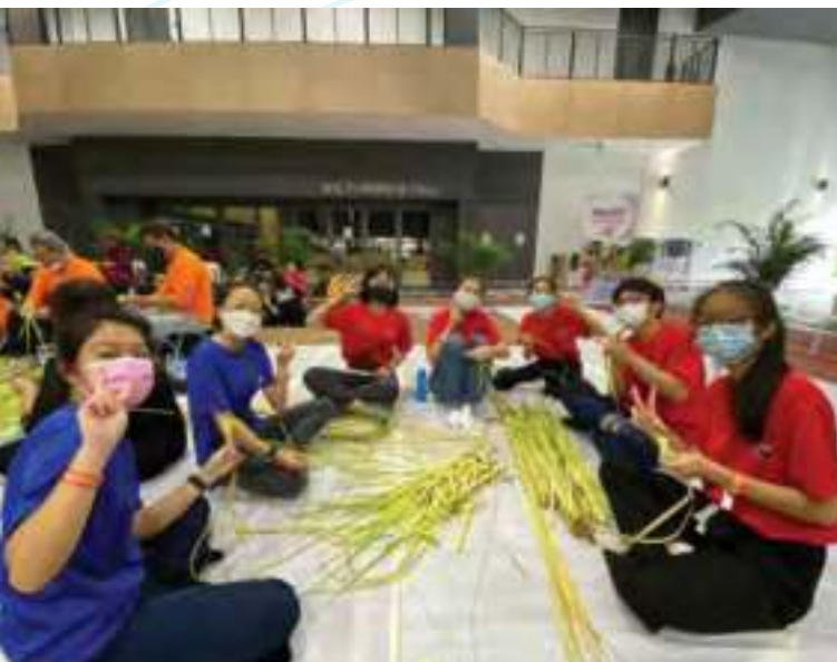
Student leaders volunteering at Jurong Spring Community Centre

Students will also participate in a variety of programmes such as learning journeys, National Education commemorative events, interactive theatre and performances. These programmes seek to not only inculcate in students a sense of pride in our national identity and a sense of belonging to Singapore, but also improve their understanding of how they can contribute towards the sustained development of Singapore. This will empower our students to develop into responsible, moral citizens who contribute actively to a cohesive and inclusive society.