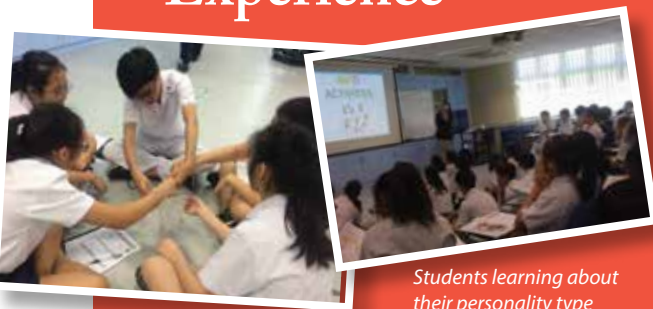
Students participating actively in the MBTI workshop

Many of the students gained a deeper understanding of the realities of different professions and attained greater clarity when it came to charting their future career pathways. The ECG Experience was enriching, and will certainly prove to be useful when the time comes to consider higher educational and career pathways.