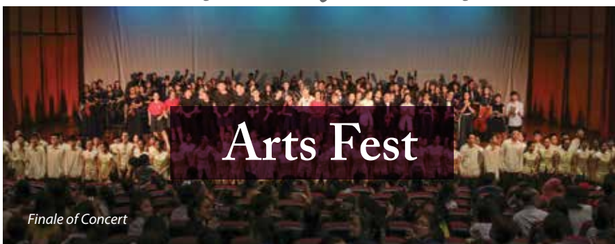
Finale of Concert

The biennial Arts Fest was held in April this year with a concert named ReVerie, an art jamming session and art exhibitions. The main intention of the Arts Fest was to promote the love of the arts to our students. The huge turnout for the two concerts by parents, teachers and students was a positive indication of the support of our Aesthetics CCAs in our school.