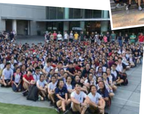
The Year 6 cohort getting ready for the Marang Trail