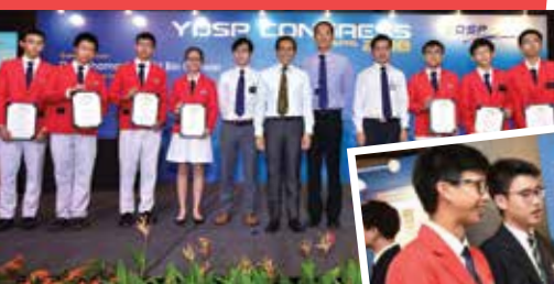
Awardees with Dr Mohamad Maliki bin Osman, Senior Minister of State, Ministry of Defence and Ministry of Foreign Affairs