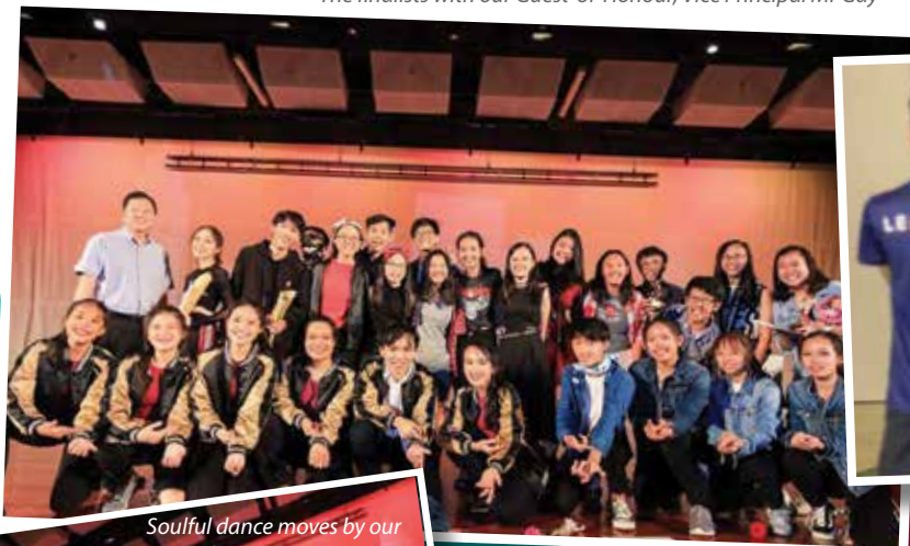
Soulful dance moves by our street dance alumni