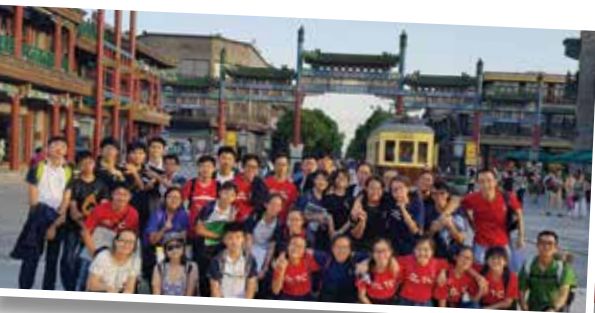
在北京前门大街合影

这次学习之旅, 不只让我们更加了解中国, 也让同学们之间的感情增进了不少, 我们在一起度过的美好时光, 将永远烙印在大伙儿脑海中。