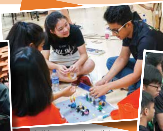
Participants generating preliminary ideas for their Area of Focus during the Pre-Seminar Workshop