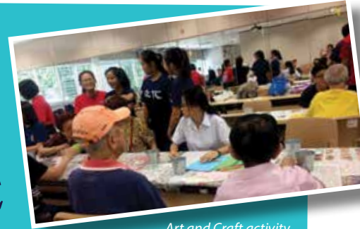
Art and Craft activity

On 25 May, our class carried out a VIA Project at Whampoa SilverACE. It turned out to be an enriching and eye-opening experience for all of us.