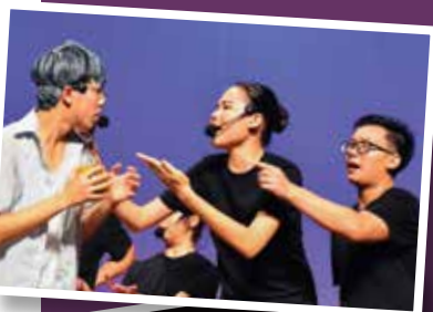
《回家》- 患失智症的老人2

The second concert started with the River Valley Chorale performing a variety of songs from 《悯农》 to "Mundi Renovatio". This is followed by Junior High Chinese Drama Society's 《赌戒》 which cautioned the audience about the detrimental effects of gambling, while the Junior High English Drama Society's "Cloud Play" explored the unexpected troubles of a young student. The Senior High English Drama Society's heart-wrenching story of a race against time followed next. The concert ended on a high note with the dancers rendering their energetic finale 《鼓韵宏程》.