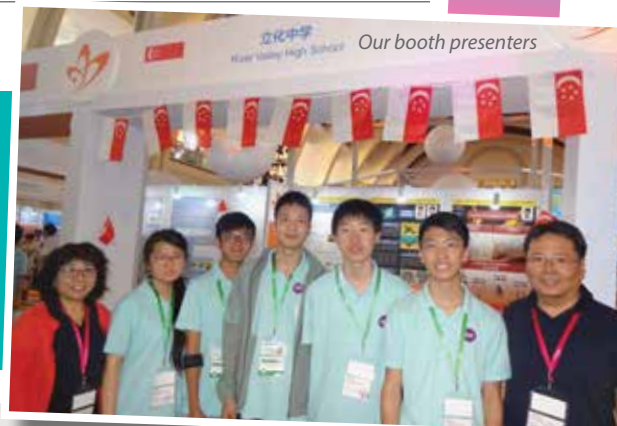
Our booth presenters