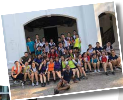
Taking a pit stop along the Southern Ridges