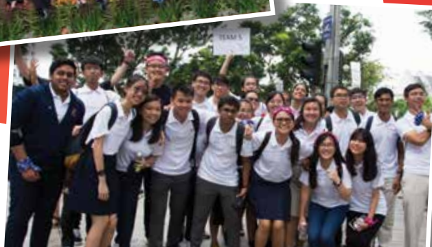
A triumphant team during the #TransformingOurSG Challenge, an island-wide trek