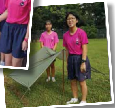
Our emergency shelter