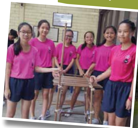
Our finished product!