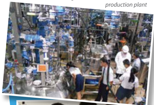
Peering into the reaction vessel at the production plant