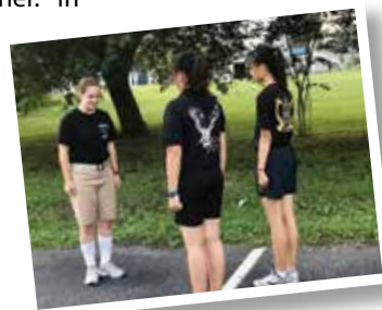
Footdrills and commands exchange with an American cadet