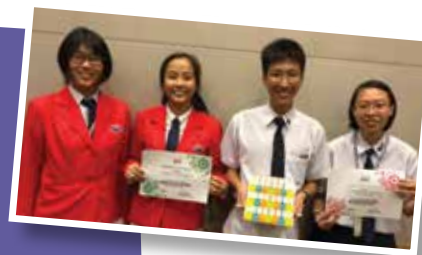
Participants at Biomedical Engineering Society Scientific Meeting

On 19 May 2018, four students participated in the Biomedical Engineering Society (BES) Scientific Meeting organised by BES Singapore. This annual symposium provides a platform for students from junior colleges, polytechnics, undergraduate and graduate levels to interact and share biomedical engineering knowledge of the biomedical engineering industry.