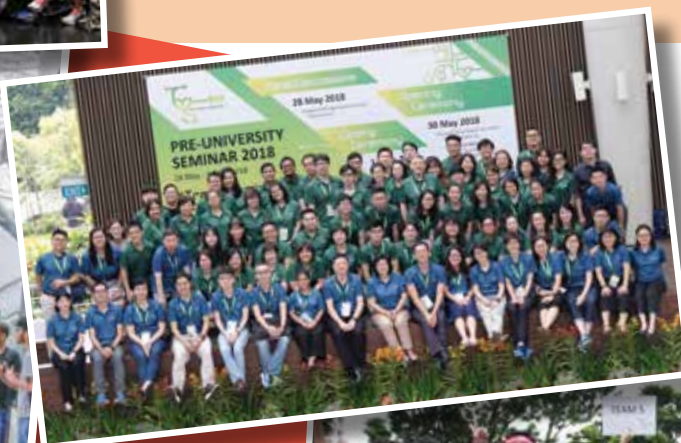
RV Staff - Organisers of Pre-university Seminar 2018

The theme for Pre-University Seminar 2018 was '#TransformingOurSG'. The theme focused on the need for young Singaporeans to cherish the strong foundations they have inherited whilst re-evaluating established assumptions and practices, and exploring novel ideas and approaches. The theme incorporated the use of the hashtag to symbolise the underlying importance of technology in every area of Singapore's transformation. The theme also recognised the ubiquity of social media and the opportunities to guide and mentor participants in developing personal and communal responsibility when sharing ideas, and expressing themselves online.