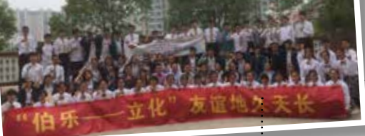
与南京伯乐中学的学生交流