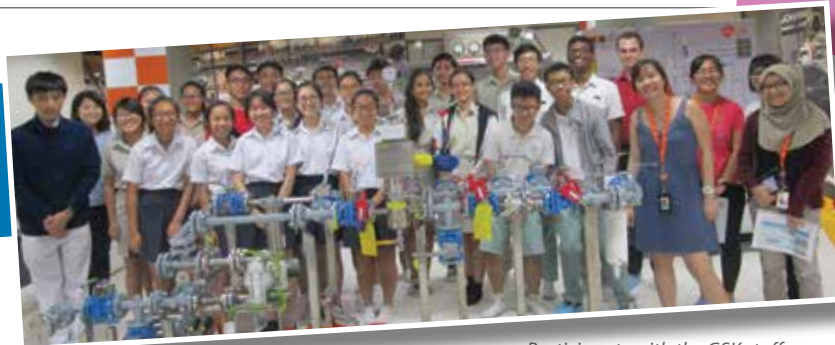
Participants with the GSK staff