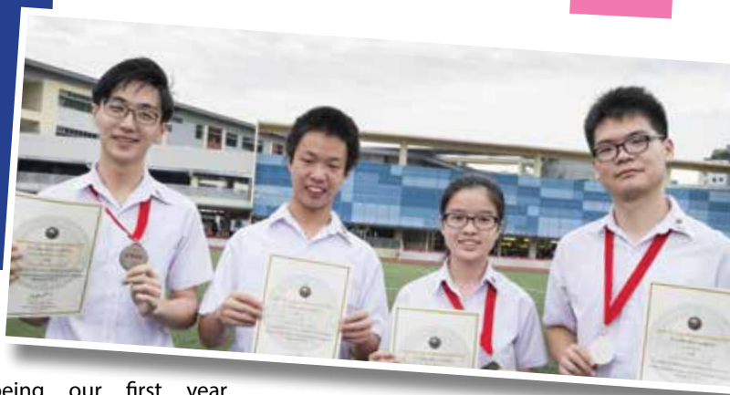
Performance during the competition