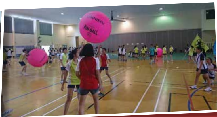
Junior High Students were keen in playing Kinball