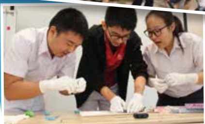
A hands-on game to learn about the importance of quality control

On 16 March, an industrial visit to GlaxoSmithKline (GSK) was jointly organised by GSK and the West Zone Centre of Excellence for Science and Technology @ RVHS. This visit involved more than 100 students from 12 different junior colleges and secondary schools in Singapore.