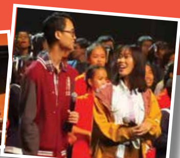
End of the Concert