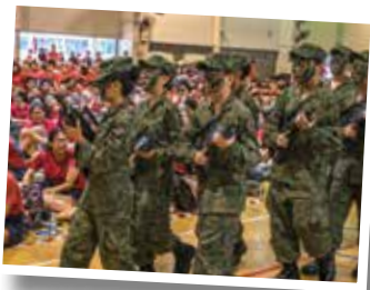
演员走进观众群互动