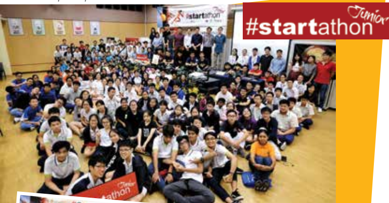
All the participants of #startathon Junior