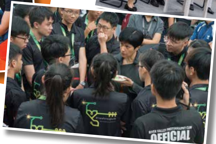
Ms Indranee Rajah, Minister, Prime Minister's Office, Second Minister for Finance, Second Minister for Education and Second Minister for Law, listens intently as a Seminar participant posed a question