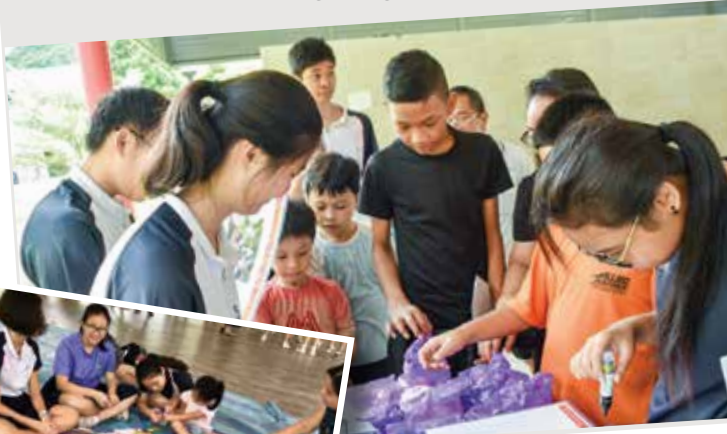
Spot the difference!