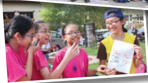
Brownies having fun

to the next step of planning and execution because we had not informed everyone about the changes we had made and this slowed down our planning process. With effective communication, everyone was better able to see the big picture and we realised that it was key to the smooth running of a programme.