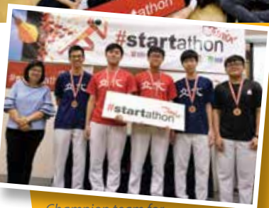
Champion team for #startathon Junior

Proudly organised by the RVHS Science Leaders Academy and Nanyang Technopreneurship Center, #startathon Junior is a 24-hour competition that aims to inspire creative thought in entrepreneurship and value-creation. This year's theme, 'Health Transformation', challenged 29 teams from various secondary schools and junior colleges to generate ideas based on the given challenge statements and to bring their ideas into reality.