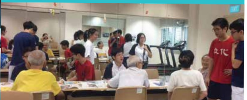
Chatting with the elderly at SilverAce Whampoa