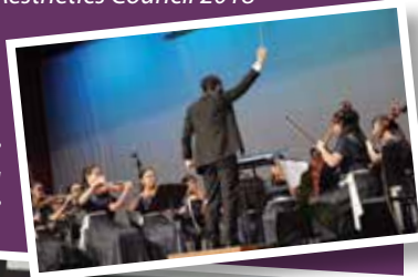
Performance by String Ensemble