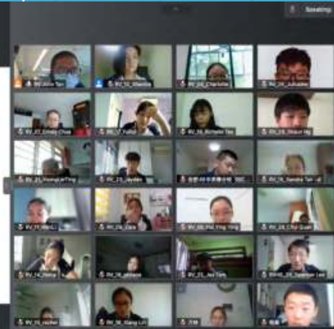
CID2 Virtual Exchange with China Schools