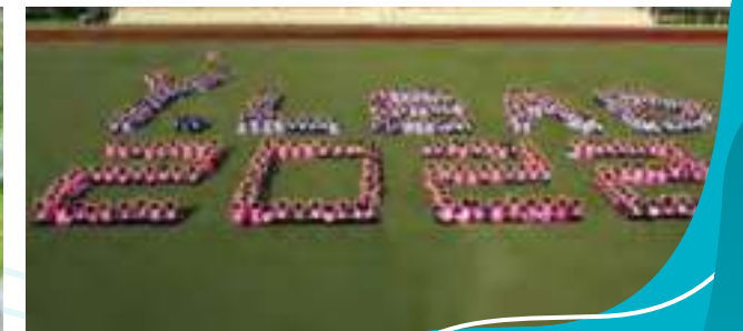
Y.LEAD Mass Display

As organisers and hosts of the Y.LEAD Seminar, RVians also gain valuable experience from conceptualising, planning and organising such a large-scale seminar.