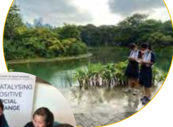
HSSLA members at Jurong Lake Park for Nature Journaling module