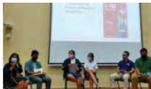
A panel discussion on race issues in Singapore by RV teachers and an alumnus.