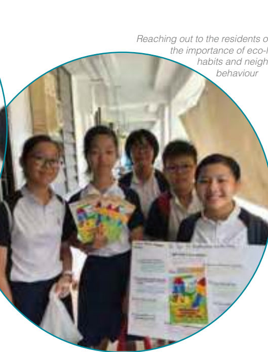
Reaching out to the residents on the importance of eco-living habits and neighbourly behaviour