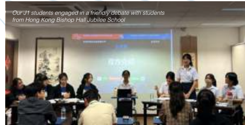
Our J1 students engaged in a friendly debate with students from Hong Kong Bishop Hall Jubilee School