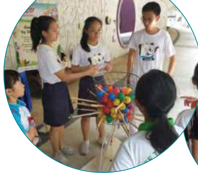
Our students explaining the rules of the game to the participants