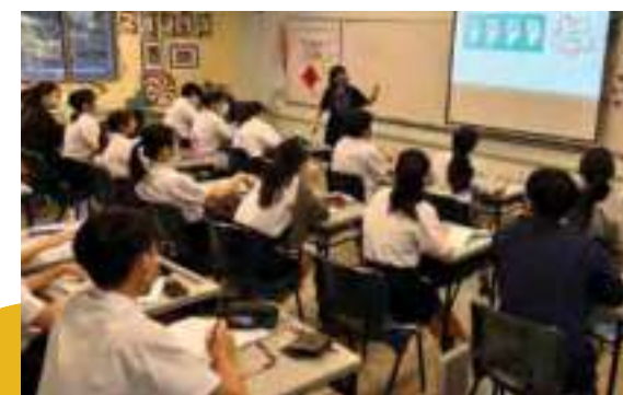
Career Guidance workshop