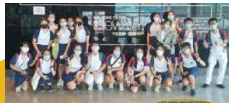
Learning Journey to NEWaterPlant

Students conduct ecological fieldwork and environmental studies investigation, and work under the guidance of researchers and lecturers at institutes of higher learning. As part of the talent management of the academy, students can also get to participate and compete in international student conferences and local workshops.