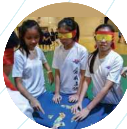
Teamwork at the Leadership Development Camp

In addition, to develop leaders of distinction for Singapore, the leadership development component of the curriculum incorporates leadership skills which are grounded in sound moral values. It is developmental and every RVian will have the opportunity to take up the mantle of leadership.