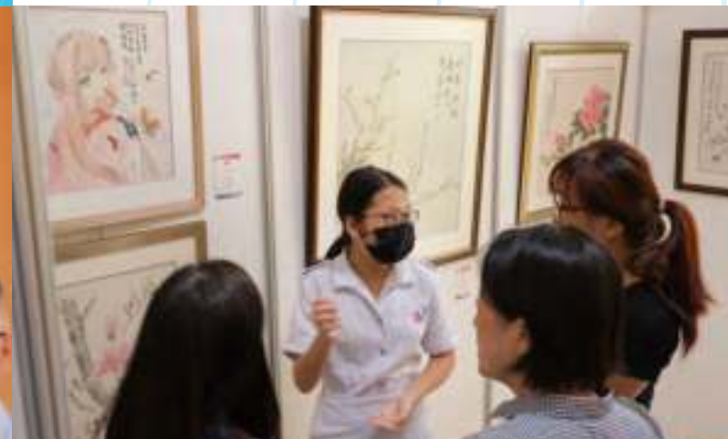
Our guests viewing our students' artwork