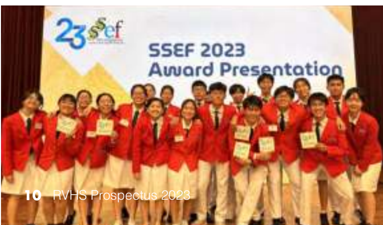
Winners of the Singapore Science & Engineering Fair