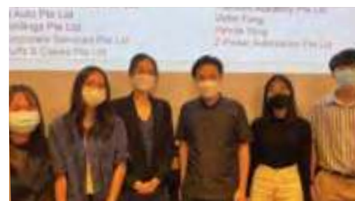
Our J2 students at a Post-Budget 2022 Dialogue with Deputy Prime Minister Mr Lawrence Wong

The programmes organised by the HSSLA include seminars and academic modules where participants acquire a multi-disciplinary perspective on issues surrounding the hyper-globalisation of modernity. Collaborations with external agencies, complemented by both local and overseas experiential learning journeys, talks and conferences with academics from institutions of higher learning provide additional platforms for HSSLA students to be the best that RVHS can offer humanity.