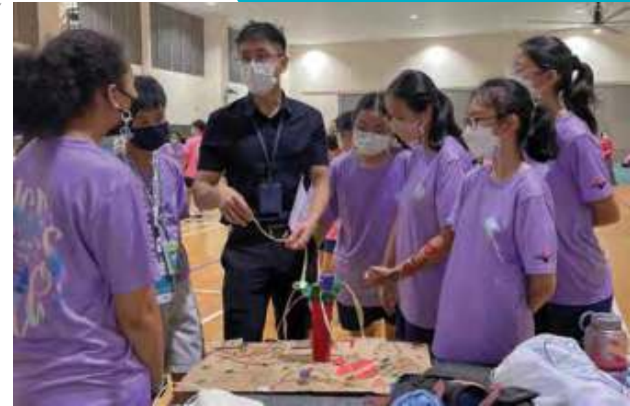
Students participating in the Rush Hour Challenge where they have to come up with a prototype to solve a problem