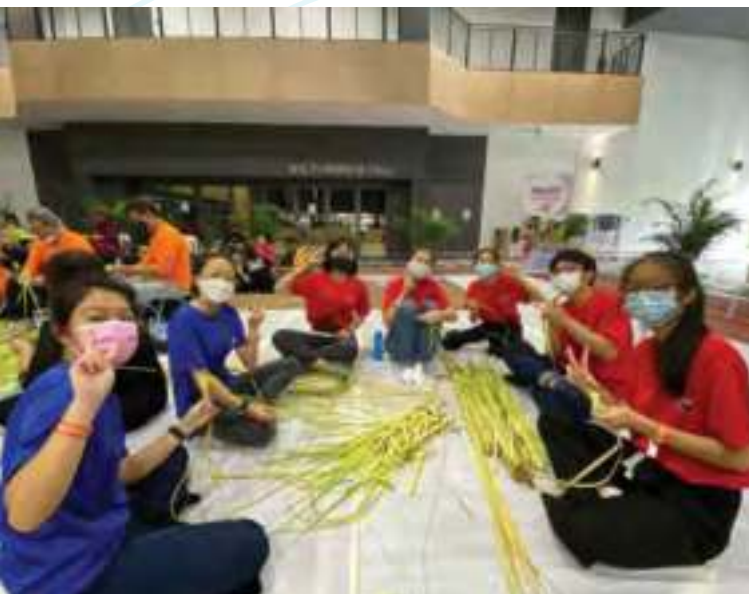
Student leaders volunteering at Jurong Spring Community Centre

At the Team and Community Leadership levels, students take up appointments and responsibilities in their various CCAs, Councils and Academies. The RV student leaders have a myriad of opportunities to serve, be empowered and to inspire RVians through different areas of interests and platforms. Students positively influence others, are proactive in addressing community needs, and show interest in national and global issues. They will also have opportunities to engage and interact with other student leaders, local and overseas.