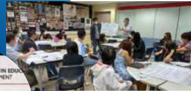
Our Senior Teachers sharing best practices on positive education with the staff