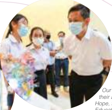
Our students explaining their artwork, Blooming Hope, to Minister for Education Mr Chan Chun Sing