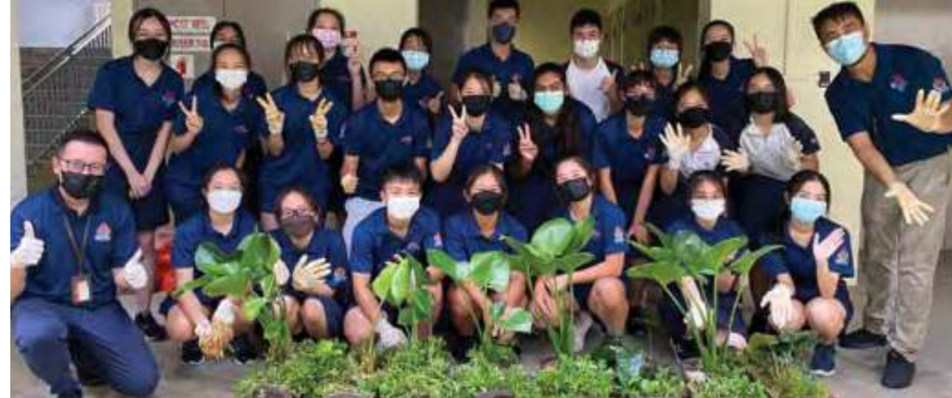
Planting new life