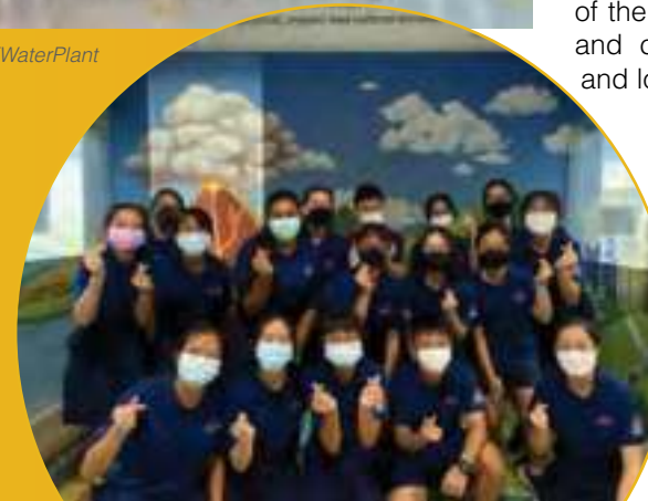
TESLA CCA Session