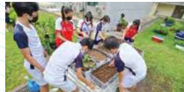
Our students harvesting their Japanese Kailan from their class farm

The RV Values In Action (VIA) programme focuses on inculcating in students an awareness of issues surrounding them and exercising social responsibility in their spheres of influence. It aims to develop students through the six domains of Character and Citizenship Education (CCE) which are: Self, Family, School, Community, Nation and World. Through the VIA project cycle, students will learn to investigate areas of concerns, empathise with others, implement their plans to create value in the community they live in and play their part through meaningful contributions to the community.